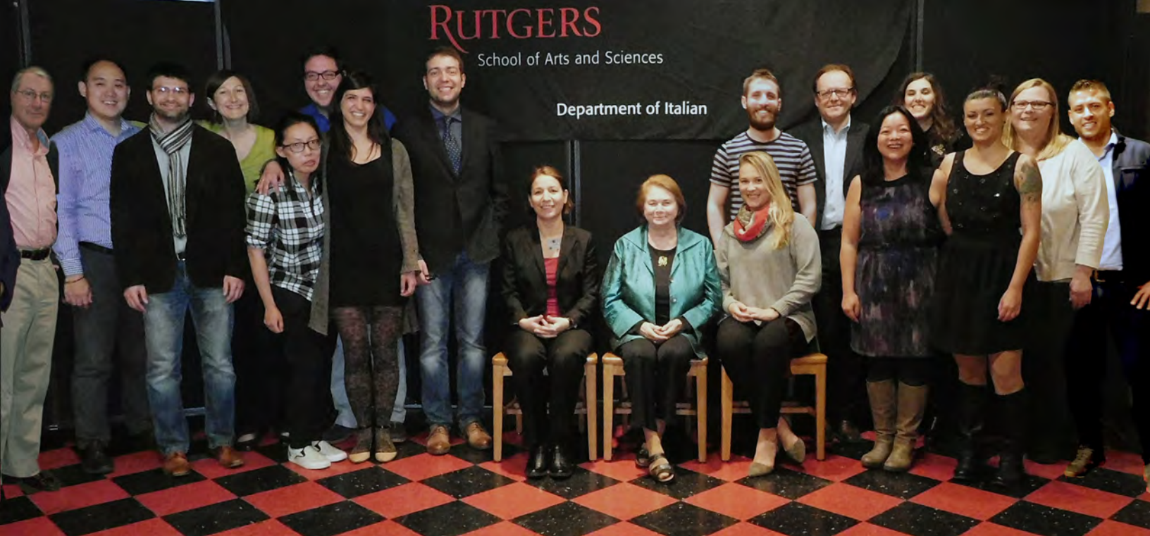
ABOVE: Rutgers Italian Department

visit our website: http://italian.rutgers.edu/