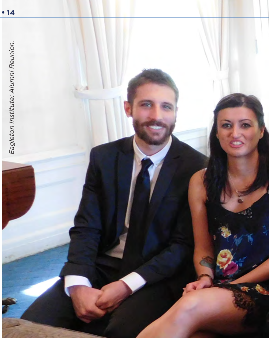
Eagleton Institute: Alumni Reunion.