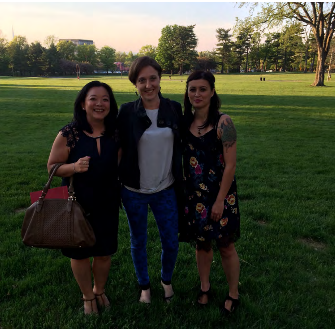
LEFT: Eagleton Institute: Alumni Reunion.